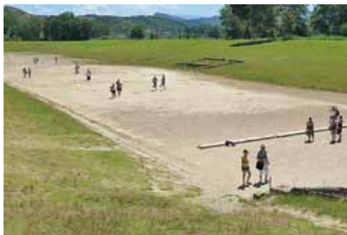
The stadium at Ancient Olympia

Explore the ideals of Ancient Greece on a guided tour encompassing the main site, incredible new museum and the ancient stadium - an opportunity to walk in the footsteps of athletes from over 3000 years ago.