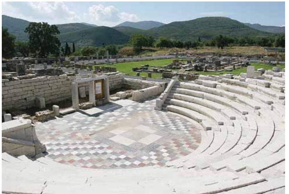
The Bouleuterion at Ancient Messini

For participants looking for a dining adventure we will arrange a transfer to Marathopolis for open air dining in a sea-side taverna