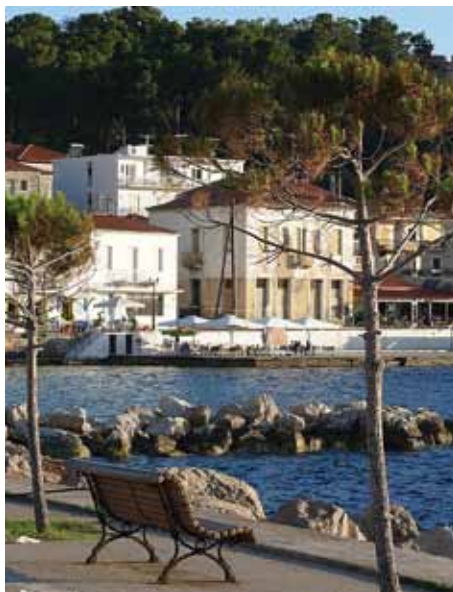
Pylos, the Greek Riviera

Travel insurance must be taken to cover the entire period of your time away. Contact Hawthorn Travel & Cruise or your preferred agent for the insurance cover best suited to your needs.