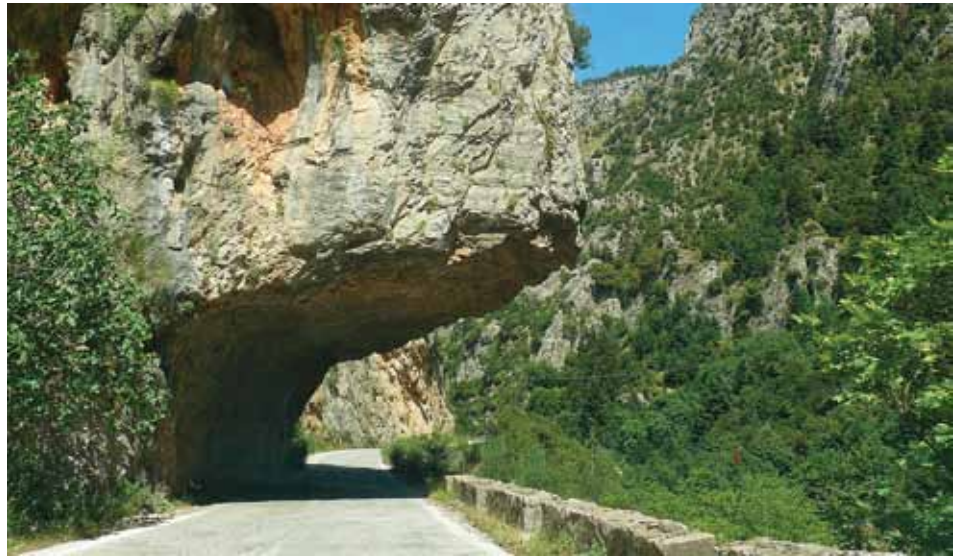
The drive to Mystras offers stunning vistas through Langada Gorge

Includes escorted transfer, entrance fees to Mystras, English speaking guide and lunch.