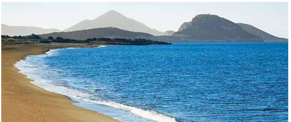
Costa Navarino's untouched beaches