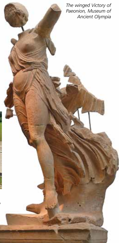
The winged Victory of Paeonion, Museum of Ancient Olympia

PLEASE NOTE that tours and events are subject to minimum numbers and acceptable weather conditions. Alternative schedules may be organized for Costa Navarino 2014, if so advised, in light of numbers and/or prevailing sea or weather conditions. If walking is likely to be involved, participants should wear comfortable walking shoes and to have a hat and/or sunscreen for outdoor activities. Additional tickets/places for friends, guests and children are in all cases strictly subject to availability. Please also note the dress code for admission to any Churches and Monasteries, as detailed in the General Information section.