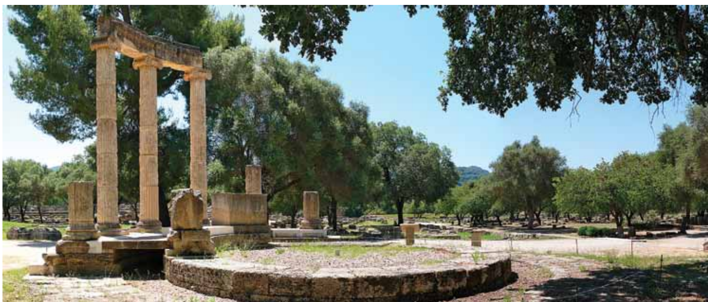
The Philippeion Temple at Ancient Olympia, erected by Philipp of Macedon, father of Alexander the Great

There will then be a short stroll to a nearby restaurant for lunch, before we continue our journey across the northern Peloponnese, with a stop for coffee and refreshments, before arriving at Athens International Airport.