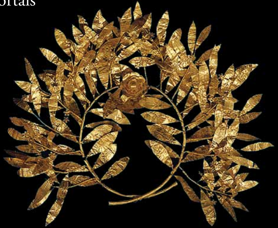
Image: Gold Myrtle Wreath (4th – 3rd Century B.C.) Benaki Collection.

The Hellenic Museum commences its partnership with the Benaki Museum through a permanent collection, on display from April 2014, which chronicles the impact of historical and social development on identity, from the Pre-Historic period to modern day. The Benaki Museum is consistently placed in a world ranking, alongside the likes of the Louvre and the MET, recognised in listings such as the UK's Telegraph The World's Best Museums: a guide . From figurines to tools, vessels, jewellery, manuscripts and costumes, this permanent collection will give Australians a tremendous, ongoing resource of cultural and historical value, while providing insight and challenge to our perspectives and beliefs.