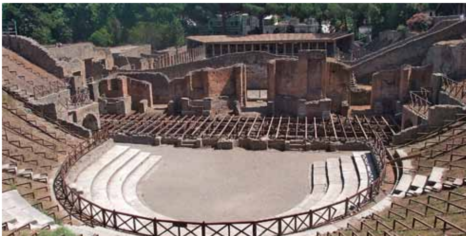
The Odeon in Pompeii

NOTE: Participants are advised to wear comfortable shoes for this entire tour as it includes a bit of walking.