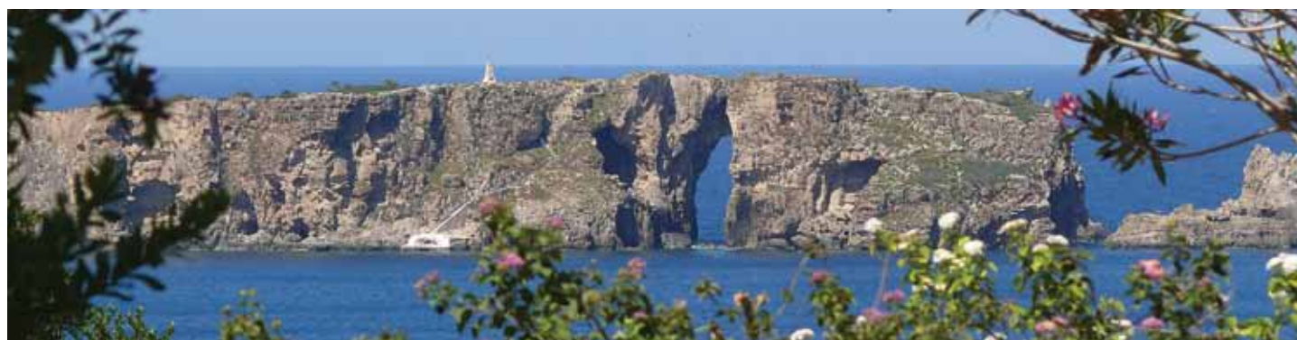
Fortress of Pylos - View from the ramparts