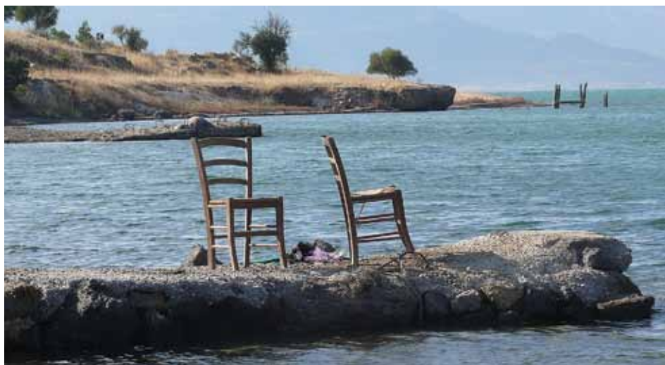
"Philosopher's Chairs" - Pirra, Aristotle's home for three years.