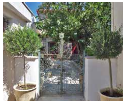
Welcome entrance to Eugenia's village home

Following breakfast, we depart for the Monastery of Agios Ignatios. The Monastery includes a Folk Museum with a library dating back to 1498. We continue to Skala Erresos, a seaside village with a large sandy beach and the birth place of the Lyric poet, Sappho. Following Skala