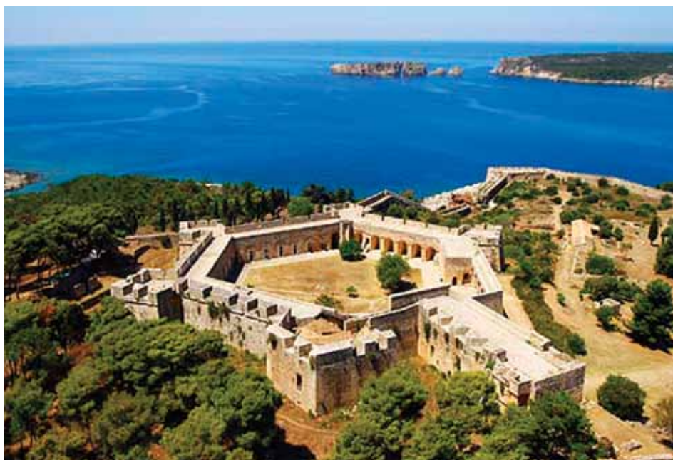
Fortress of Pylos - Setting for our cultural evening recital

Participants will depart for the Fortress of Pylos to enjoy an elegant evening of Greek and Classical music at our cultural concert recital (weather permitting). The Fortress of Pylos is one of the best preserved castles in Greece, a splendid example of sixteenth century military architecture with a stunning view overlooking the Bay of Navarino. Built by the Ottomans in 1573 during the Turkish occupation, the fortress has passed through many hands including the Venetians. Following the performance, participants may dine (at their own expense) in the traditional seaside "tavernas" of Pylos. Return transfers will be available from 22.30 but participants who choose to remain longer will have to arrange their own return to the Romanos Resort.