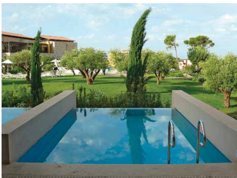
View of Costa Navarino grounds from infinity room deck

athena@hawthorntravel.com.au tracey@hawthorntravel.com.au