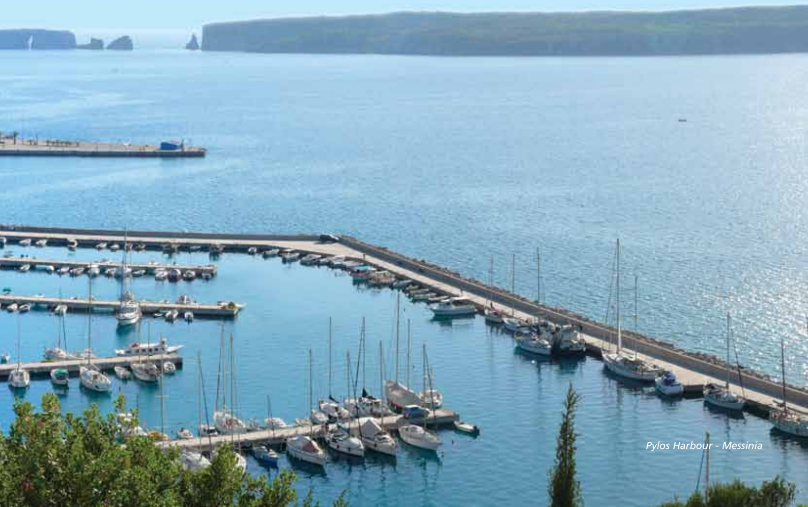
Pylos Harbour - Messinia