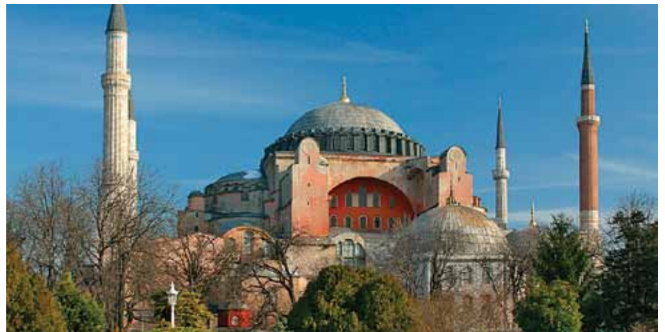
Hagia Sophia - Istanbul