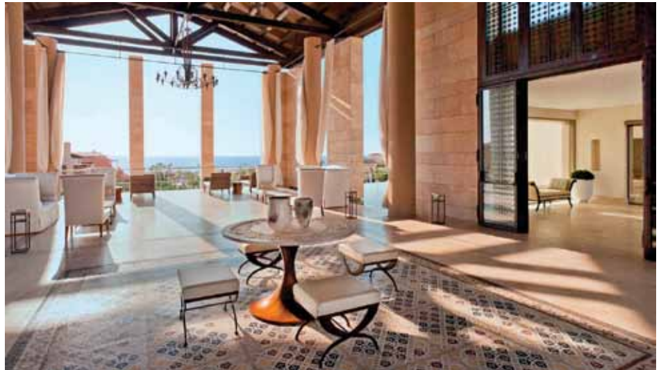
Foyer of the Romanos

For more information about the resort visit: www.costanavarino.com