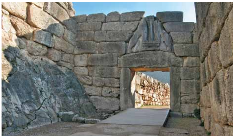
The Lion's Gate - Mycenae

Tour includes escorted transfer, entrance to all sites, English speaking guide, and lunch.