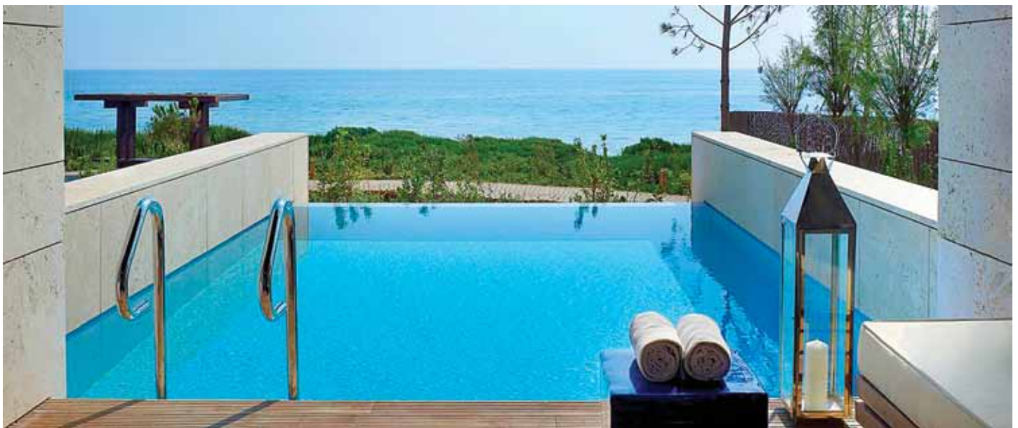
Romanos Infinity Room

Post conference tours organised by our general agents in Greece Topline Travel. Email: info@toplinetravel.gr