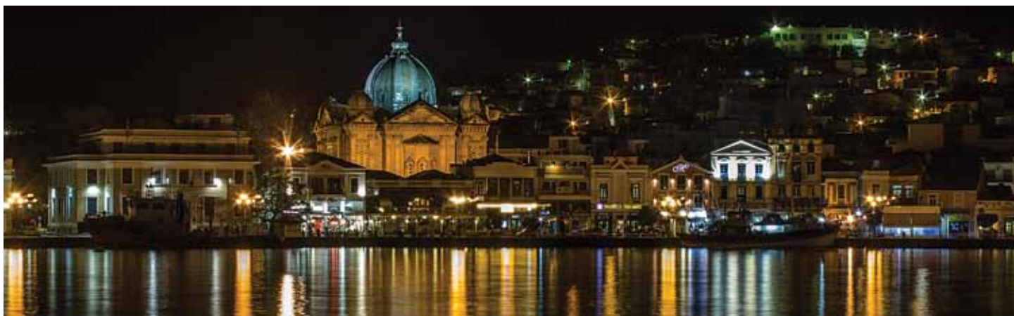
Mytilene Harbour at night

26 September - 2 October 2014 (6 nights / 7 days)