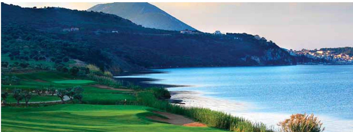
Stunning sea views from one of Costa Navarino's three world-class golf courses

Welcome Reception at the Romanos for all delegates and guests.