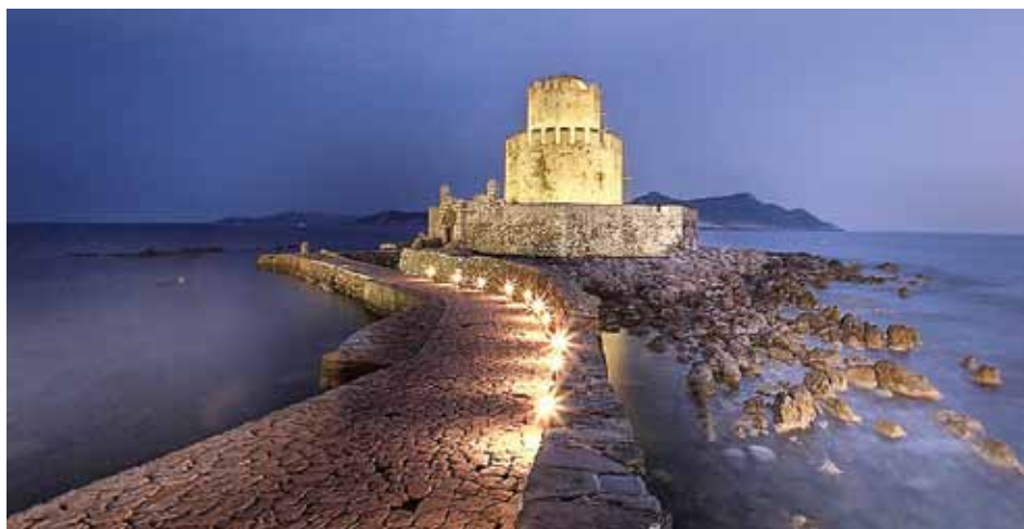
Part of Koroni's Byzantine Fortress

Alfresco dinner in waterfront taverna with local entertainment.