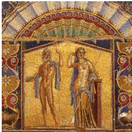
Mosaic of Neptune at Herculaneum