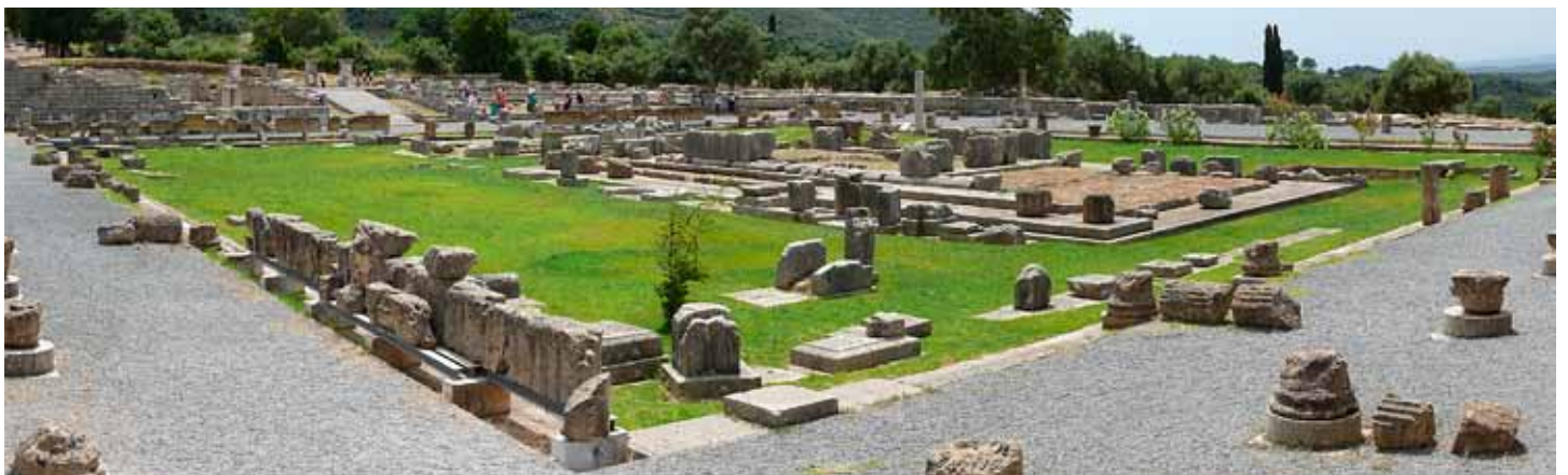
The Asclepeion at Ancient Messini