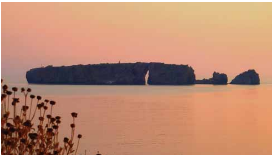
Sunset over the Bay of Navarino

All foreign visitors entering Greece must be in possession of a passport or other travel documents endorsed and valid for Greece. In limited circumstances foreign nationals may require an entry visa to Greece. If so, please contact the Greek Embassy or Consulate. Holders of standard Australian passports do not require an entry visa. For any further information please contact Hawthorn Travel & Cruise or your preferred