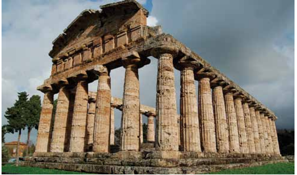
Temple of Athena at Paestum

Our guide will take participants on a morning tour of the ancient city of Naples which includes a visit to some of Naples' greatest landmarks, before heading down to see the excavations made by the ancient Greeks themselves. After lunch, visit the National Museum, treasury of some of the rarest artwork of the Archaic period (800 – 480 BC). Overnight at Grand Hotel Parkers, Naples.